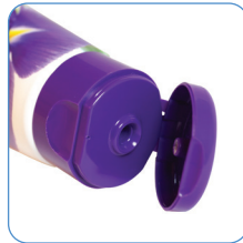
Glossy & Matte

STAND UP, SCREW-ON CYLINDRICAL + ELLIPTICAL