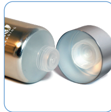
Glossy & Matte

METALLIZED/SPECIALTY OVER SHELLS AVAILABLE