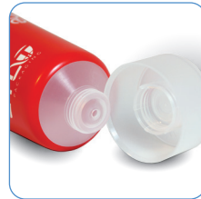
Glossy & Matte

STAND UP, SCREW-ON CYLINDRICAL + ELLIPTICAL